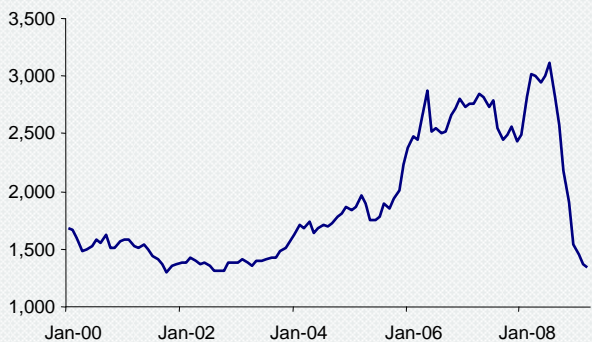
LME 3M Aluminum Average Monthly Prices